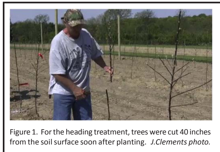
Figure 1. For the heading treatment, trees were cut 40 inches from the soil surface soon after planting. J.Clements photo.

that is not necessarily desirable in high-density orchards. Bud 'notching' and benzyladenine (BA) application are two other methods to promote branching in young trees.