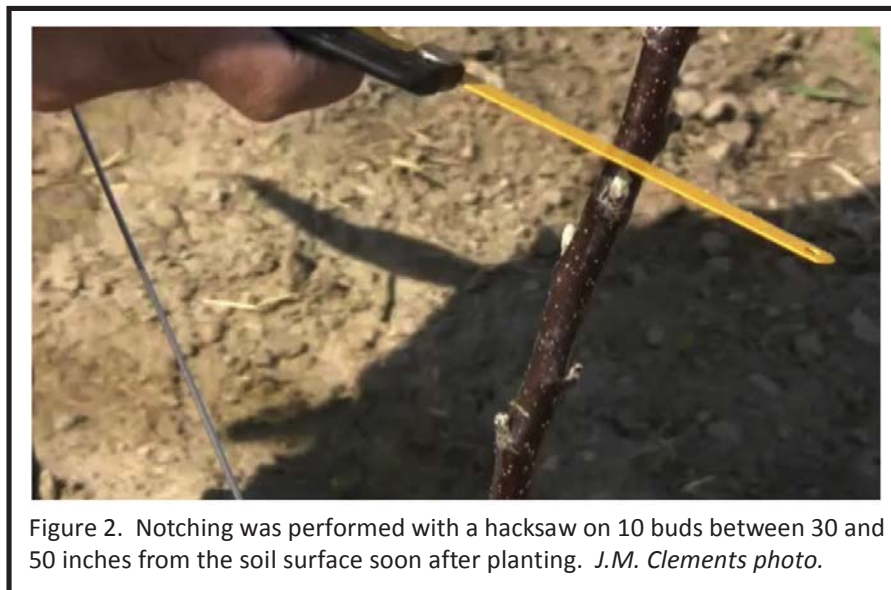
Figure 2. Notching was performed with a hacksaw on 10 buds between 30 and 50 inches from the soil surface soon after planting.

When planting high-density apple orchards on dwarf rootstocks, it is best to use well branched nursery trees so that early production and profitability are maximized. Often, however, nursery trees arrive with less than the optimum number of branches, or worse, are nearly 'whips' with no branches at all. Hence, steps are often taken to promote branching. In semi-dwarf orchard systems at wider spacing a heading cut is very effective at creating branches, however, may have an invigorating effect