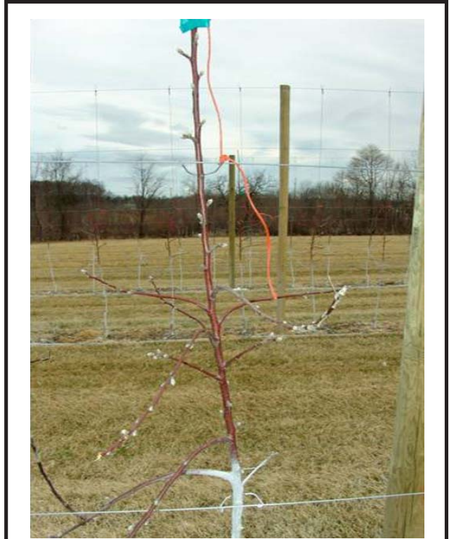
Figure 5. Notched tree after one season.