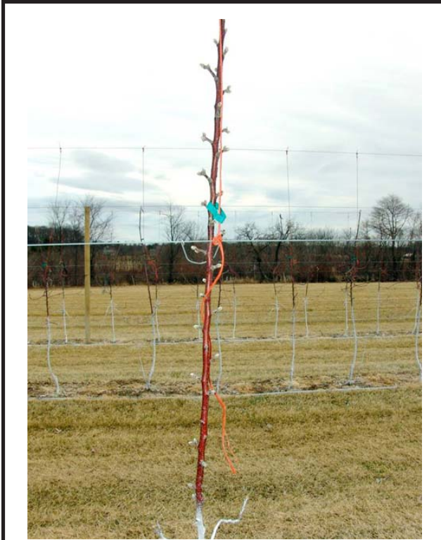
Figure 4. Untreated tree after one season.