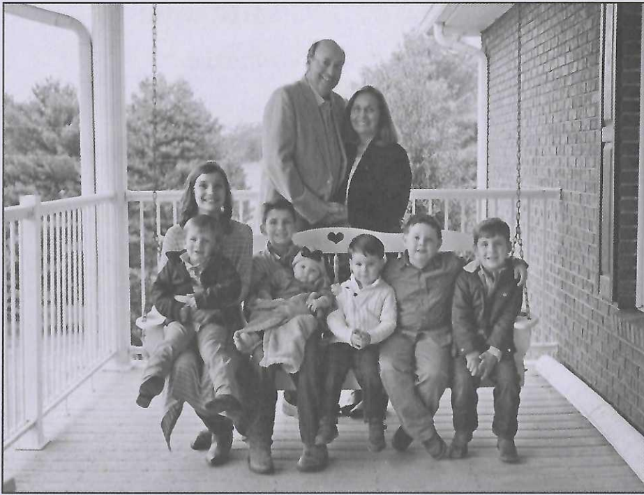
Cumberland Valley's Future Generation